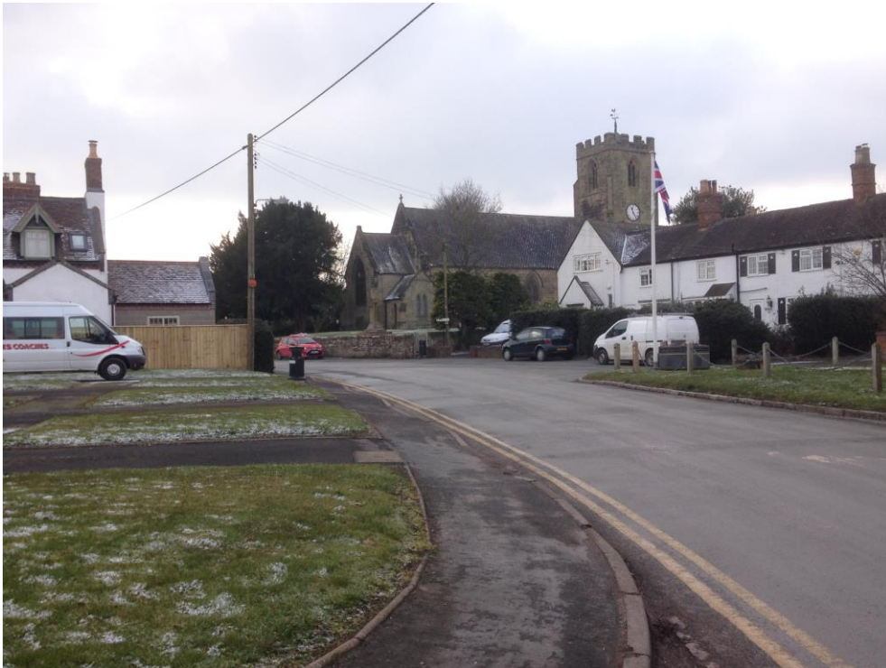
View south towards St. Peter's Church from Drayton Lane

The settlement appears to have developed in the late 18 th and early 19 th Centuries at the edge of the park associated with Drayton Manor, the seat of the Peel family.