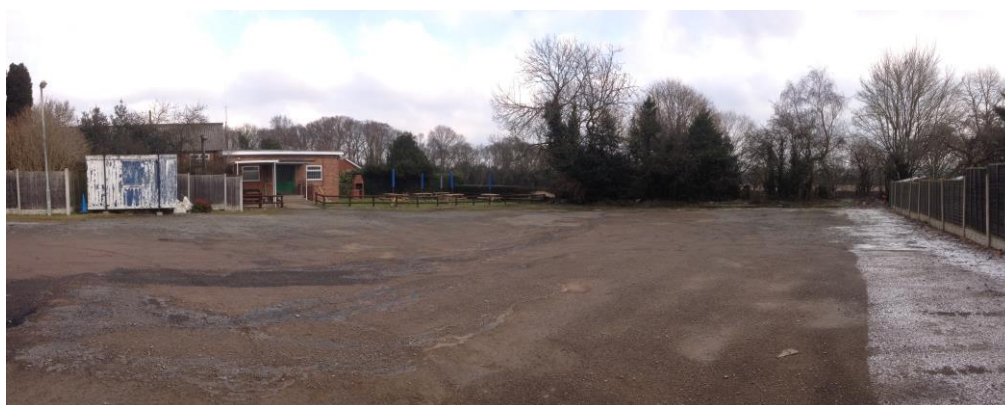
Surface car parking, Drayton Lane

There are a few areas of the conservation area that could be considered to be negative and that detract from the conservation area due to their poor condition.