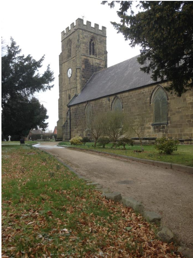
Parish Church of St. Peter

The parish church of St. Peter is Grade II* listed, and is the only listed building within the village.