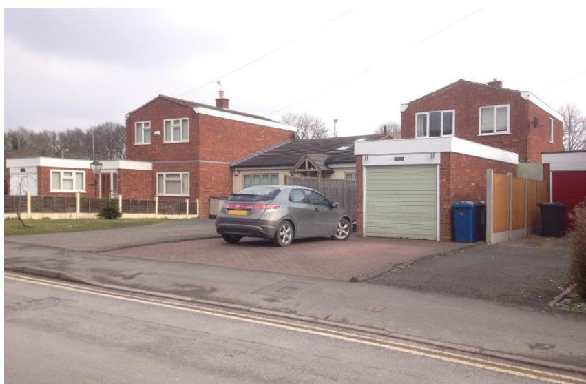
Later 20 th Century housing immediately adjacent to the Conservation Area

There are also a number of neutral elements within the conservation area. These are buildings or other structures which while not contributing positively to the character of the conservation area nor do they detract from it. These mainly consist of 20 th century dwellings.