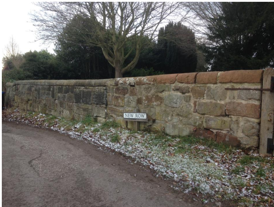
Potential Medieval and Eighteenth Century stonework in Churchyard wall

The natural environment is a key element in the character and the appearance of the Conservation Area. The extensive hedgerows to the front of New Row form a distinctive element to the character of the Conservation Area.