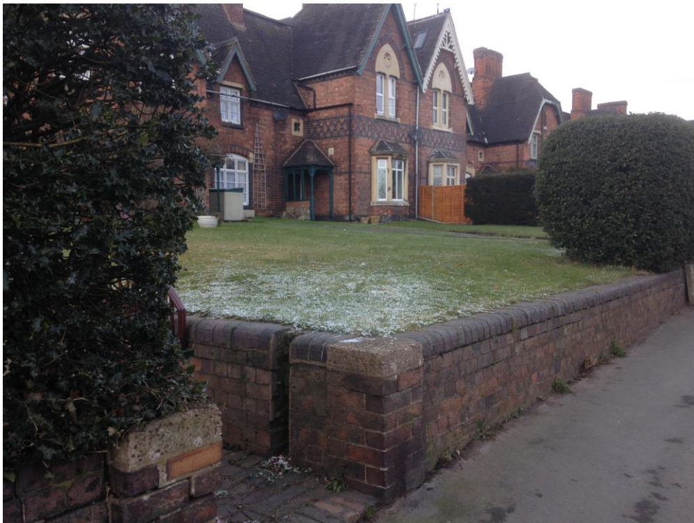
Section of boundary hedge removed, New Row, Drayton Lane

The majority of the buildings are occupied in good condition, and not considered to be at risk. The loss of enclosures to the front of properties, especially along Drayton Lane is detrimental to the character of the proposed Conservation Area.