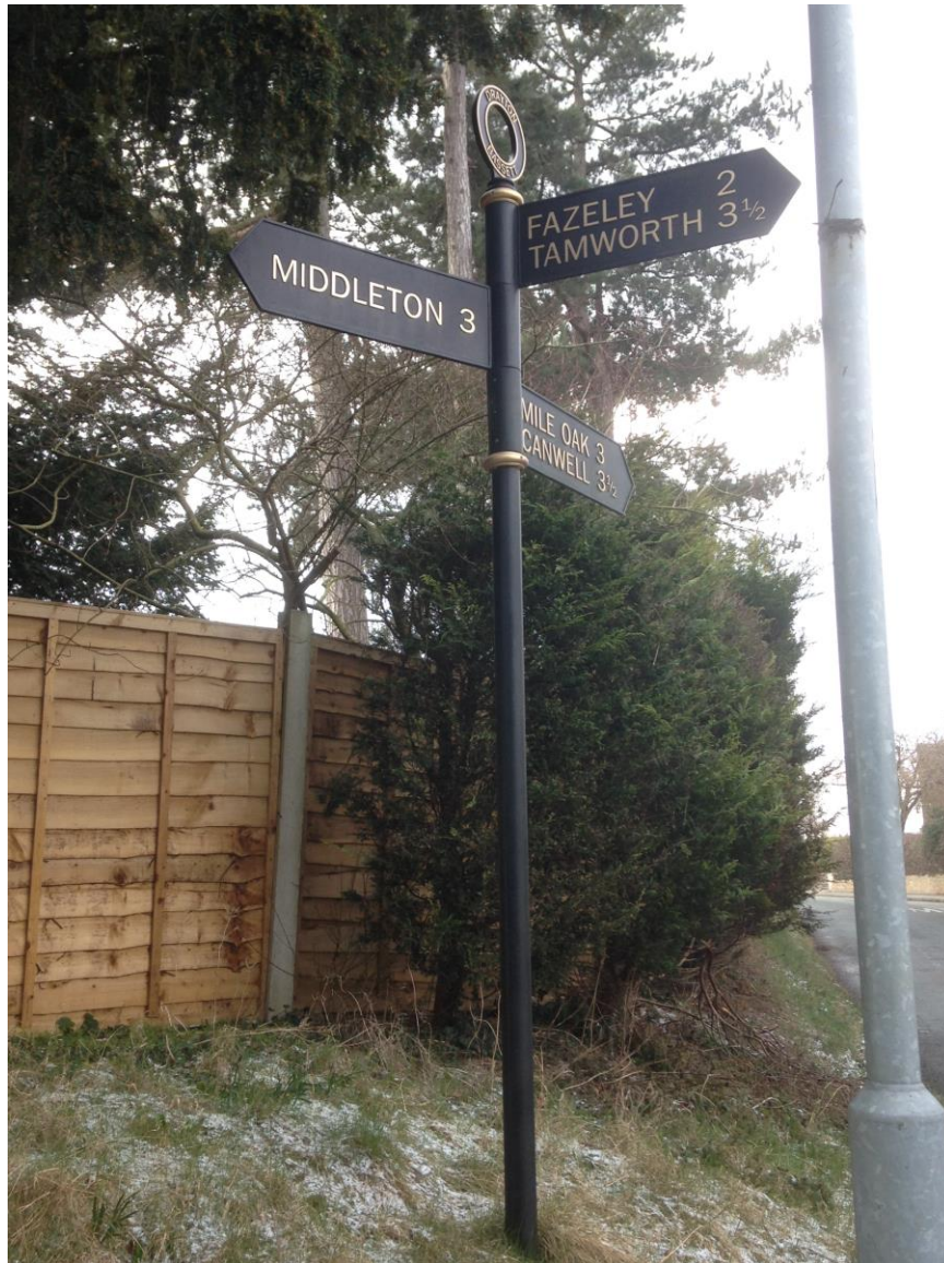
Modern street furniture

More modern street furniture also plays a role in the character of the proposed Conservation Area, with high quality modern additions such as the directional sign at the junction of Drayton Lane and Salts Lane making a positive contribution to the area.