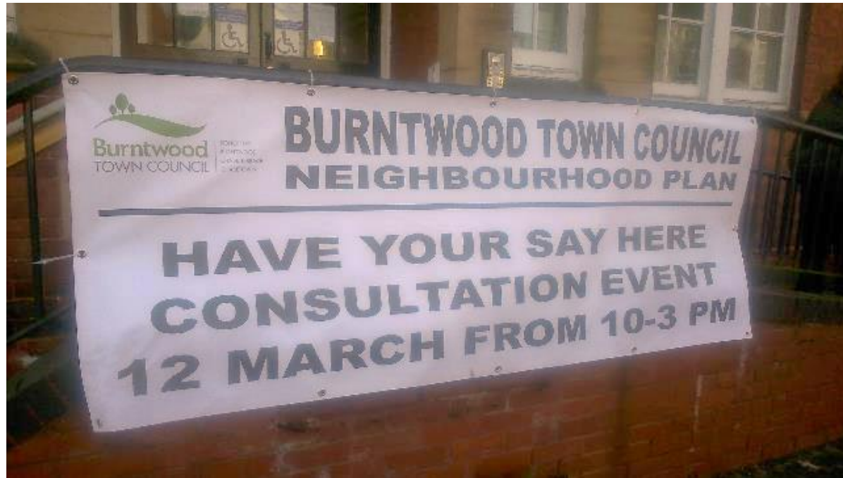
Policy Options consultation, March 2016