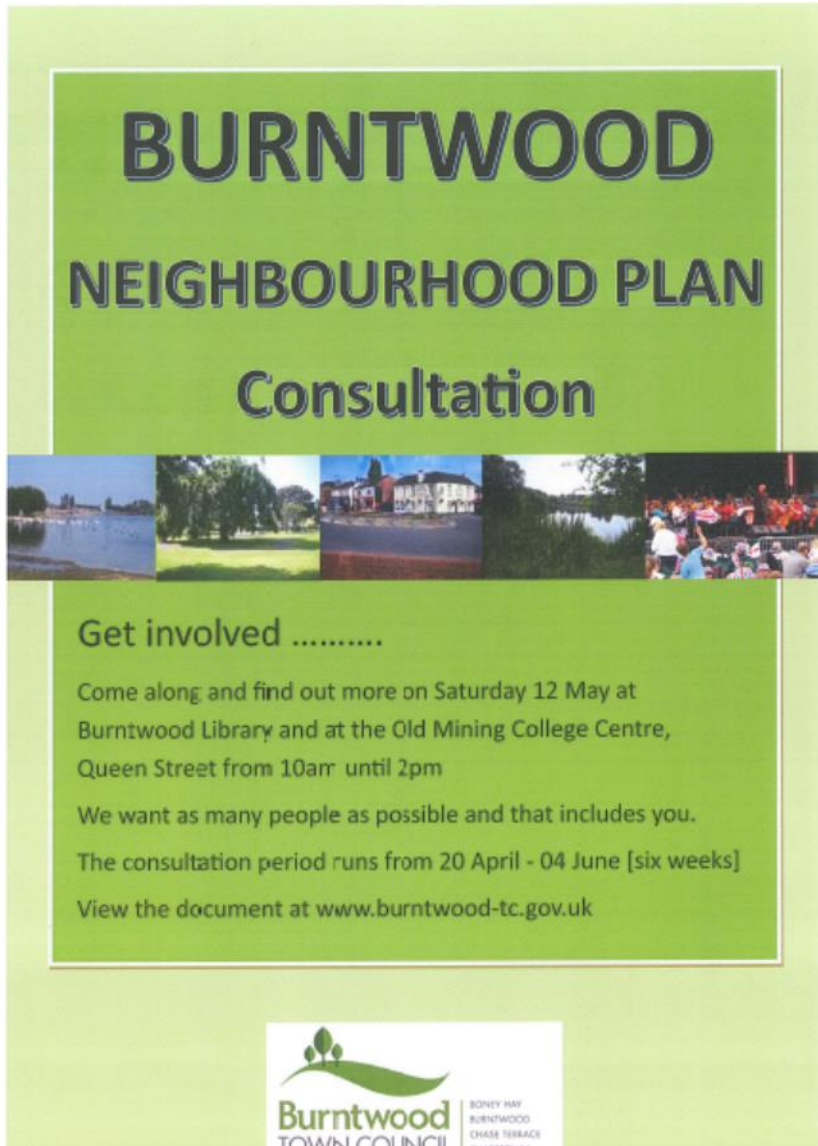
Posters were placed throughout the area to promote the Regulation 14 consultation