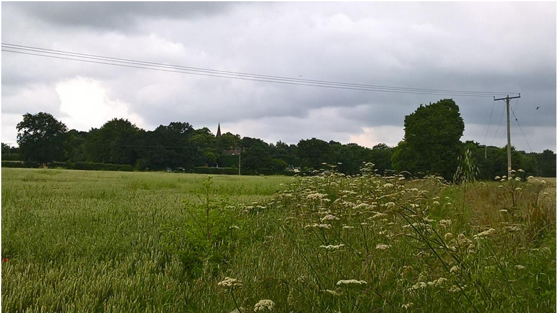
Image 1 - View of St John the Baptist Church from Footpath 7 (between Hall Lane, Gartmore Riding Stables and Sewage Works)