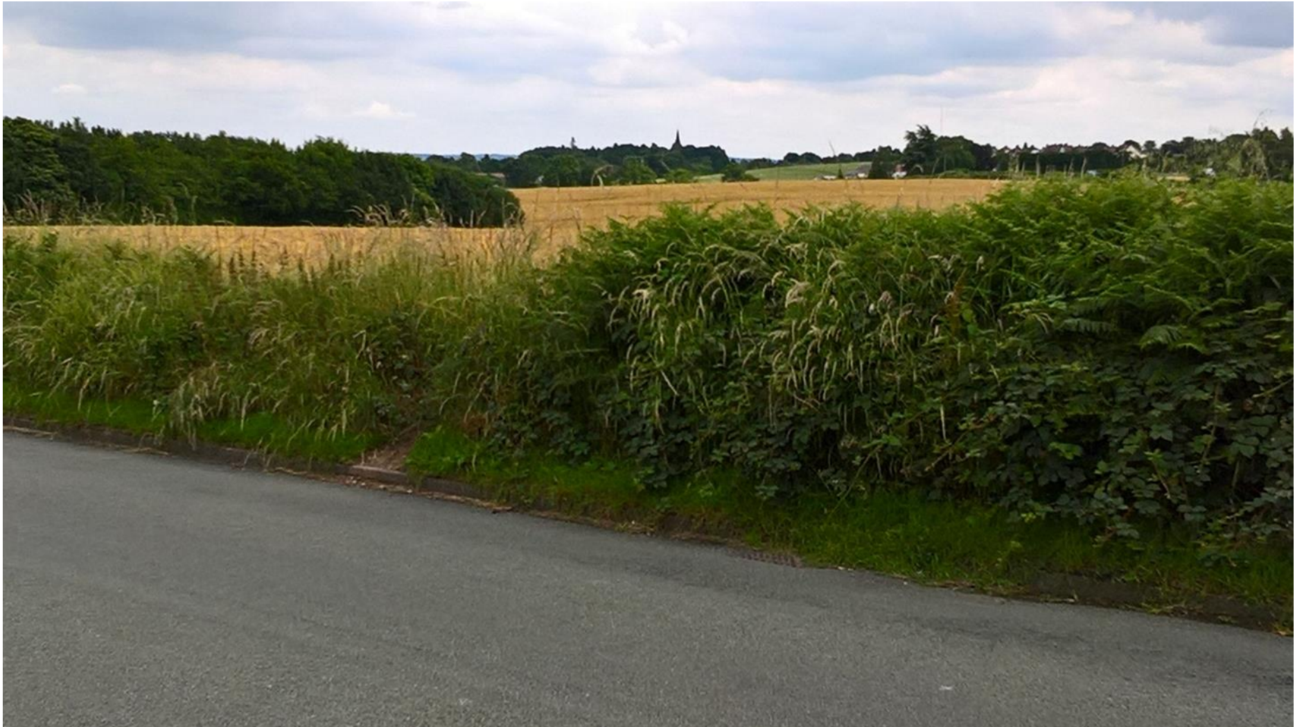
Image 3 – view from Norton Lane near junction with Hospital Road (Area 2a on NP Map 8)