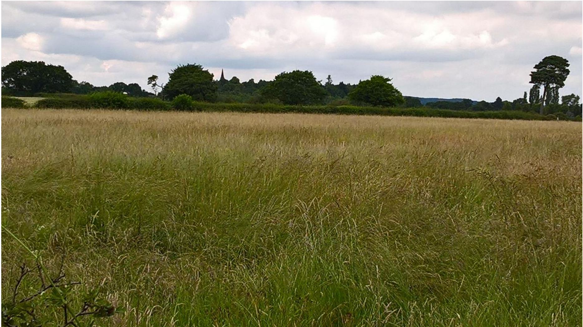
Image 5 – Church from the A5 Watling Street, immediately west of Crane Brook House (Area 2c)