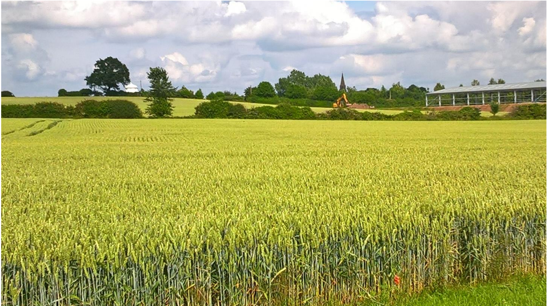
Image 4 – View of Church and former Windmill (with white cupola) from access to High Ash Grange Farm (Area 2b)