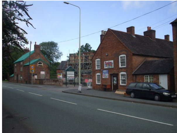
Picture 4.2 The Bonehill Mill complex, Lichfield Street