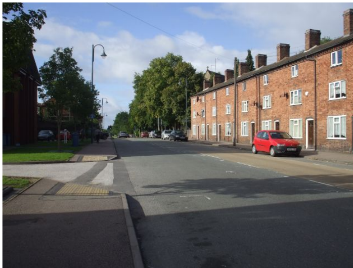
Picture 7.1 Mature trees frame the view down Coleshill Street

7.1 The natural environment, in particular heavy, mature tree cover is an integral part of the significance of the conservation area.