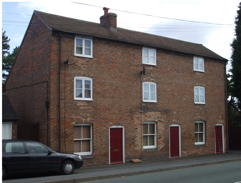
Picture 6.1 110-114 Lichfield Street, traditionally constructed housing c1790

6.1 The settlement of Fazeley prior to the mid 20th century consisted of an industrial settlement including the full range of buildings necessary for a community to live and work. The overriding cohesive factor was the functional aspect of the vast majority of buildings. The function rather than the form of a building was the prevailing influence in its design, with the exception of places of worship. This led to simple, unembellished, practical designs. However, a unified palette of materials combined with simple detailing gives a great deal of character to the area.