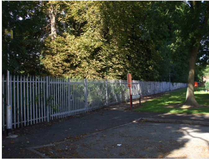
Picture 6.7 Galvanised steel palisade fencing - replacement of this type of fencing would significantly improve the appearance of the conservation area

6.12 Despite the loss of historic architectural features, the high proportion of vacant buildings and the general feeling of neglect; the industrial heritage of Fazeley and the pre-industrial/agricultural heritage of Bonehill is very important. The buildings, alongside the watercourses tell an important story.