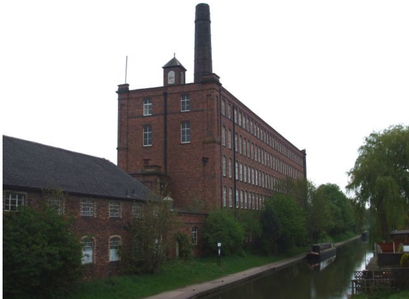
Picture 2.5 Tolsons Mill