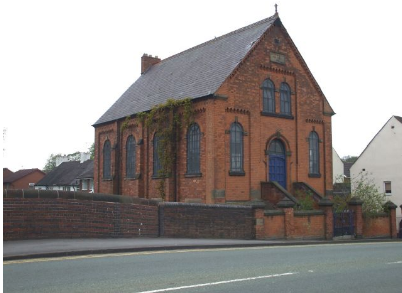
Picture 2.8 Fazeley Methodist Church, Lichfield Street