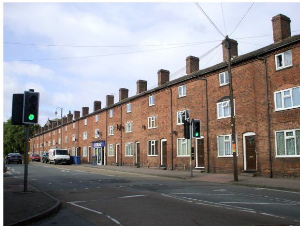
Picture 6.5 This terrace retains its uniformity despite having lost many of its original features

6.4 In terms of joinery; much of this has been lost, particularly in the very centre of Fazeley. Timber windows have been replaced by uPVC and traditional doors have been replaced with modern style doors. Furthermore window openings have been altered or new openings inserted which have different proportions to that of the traditional, original openings.