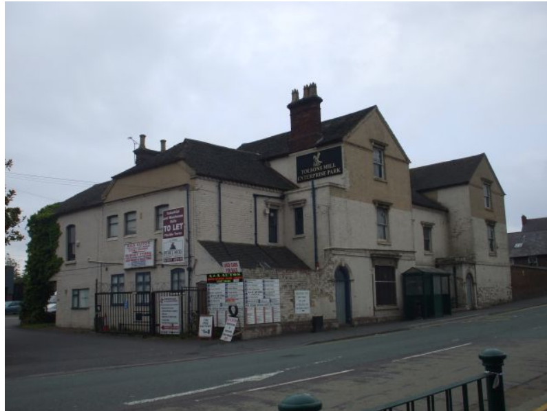
Picture 2.7 Mill House, Fazeley Street