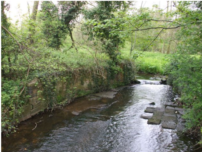
Picture 7.2 Extensive areas of tree cover and vegetation now surround much of the Peel waterways

7.2 The waterways pass through areas of dense tree cover and vegetation. This gives a rural, tranquil feel which is a pleasant contrast to the noise and activity of the main roads.