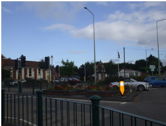
Picture 5.4 A cluttered public realm at the junction of Coleshill Street and Lichfield Street

5.12 Within Fazeley the public realm and open spaces are of mixed quality and would certainly benefit from improvements. There is a considerable amount of visual clutter including street furniture, signage and railings which could be reviewed.