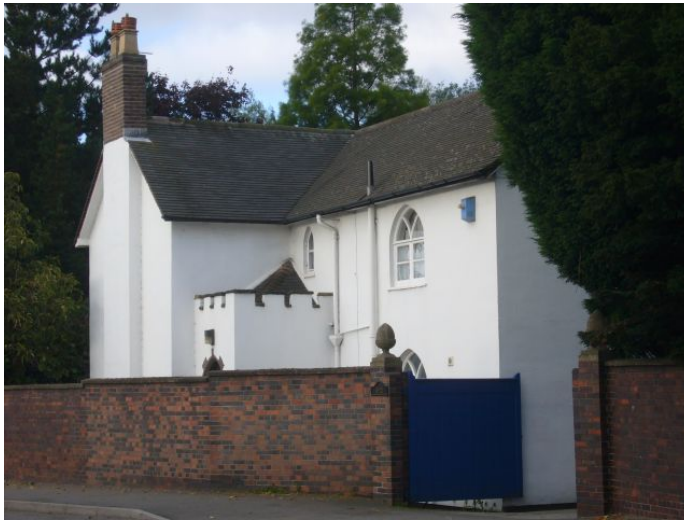
Picture 6.3 Fazeley Cottage, an early-mid 19th century gothic-style residence

6.3 Detailing throughout most of the area is simple and carried out in blue bricks or through the use of more decorative brick coursing such as Flemish bond. There is little decoration around verges and eaves further than a simple dentil course. It is the regular, repetition of architectural detailing along rows of terraced housing that provides a pleasing appearance and contributes to the character of the area. The two churches and the town hall are the exceptions to this with ornate terracotta work on the late 19th century Methodist Church and Town Hall and the mid 19th century St Paul's Church which is constructed of stone. The war memorial is also constructed of stone.