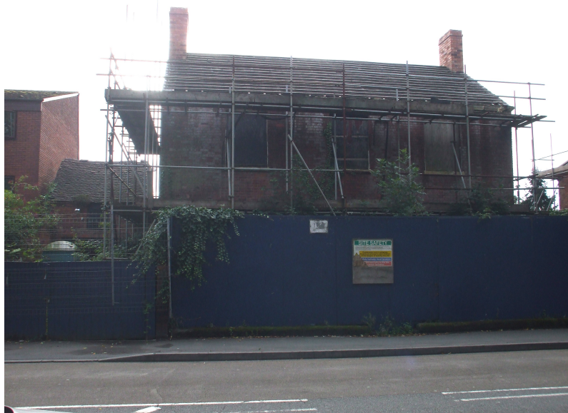
Picture 2.4 61 Coleshill Street