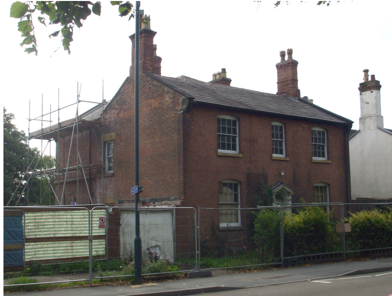
Picture 2.3 59 Coleshill Street