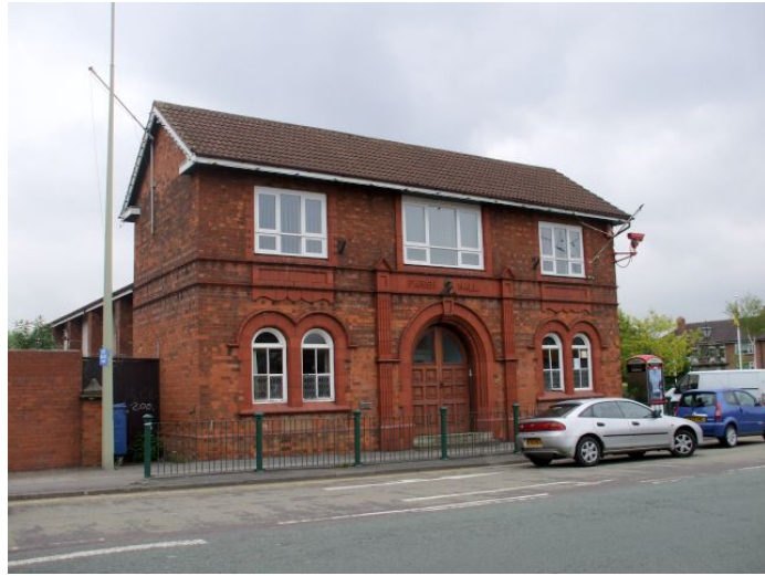
Picture 6.4 Red brick and teracotta detailing on the Town Hall

6.4 In terms of joinery; much of this has been lost, particularly in the very centre of Fazeley. Timber windows have been replaced by uPVC and traditional doors have been replaced with modern style doors. Furthermore window openings have been altered or new openings inserted which have different proportions to that of the traditional, original openings.