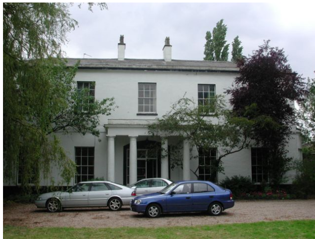
Picture 4.3 Bonehill House, Park Lane