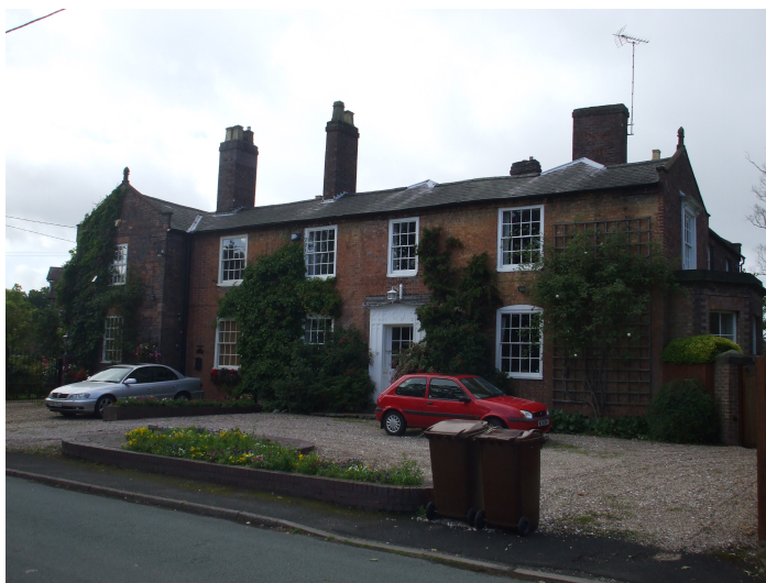
Picture 6.6 2-4 Park Lane, Bonehill built c1830

6.10 A number of other buildings positively contribute to the character of the conservation area and these are marked on the map in Appendix A. This contribution can take a number of forms.