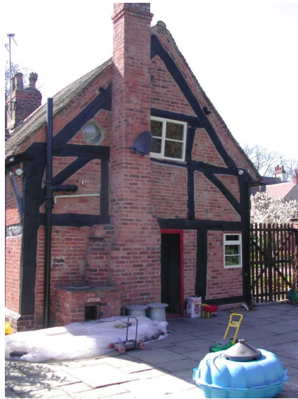
Picture 6.2 17th century timber framing in Park Lane