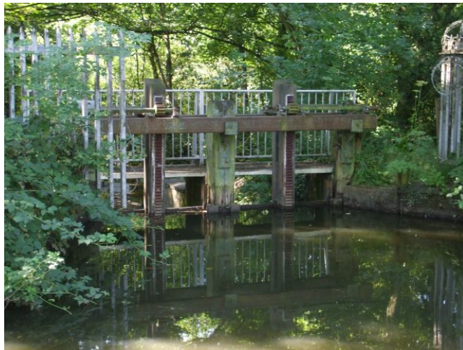
Picture 4.1 Sluice gate at west end of Mill Pool