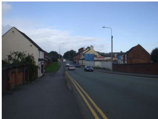
Picture 5.2 View west down Lichfield Street

5.10 Despite the construction of a new A5 in the mid-1990's there is a constant level of noise and visual disturbance from traffic. While the relationship of the settlements to these main roads is part of their history and significance the effect of the traffic that uses the roads has a detrimental impact on the whole area.