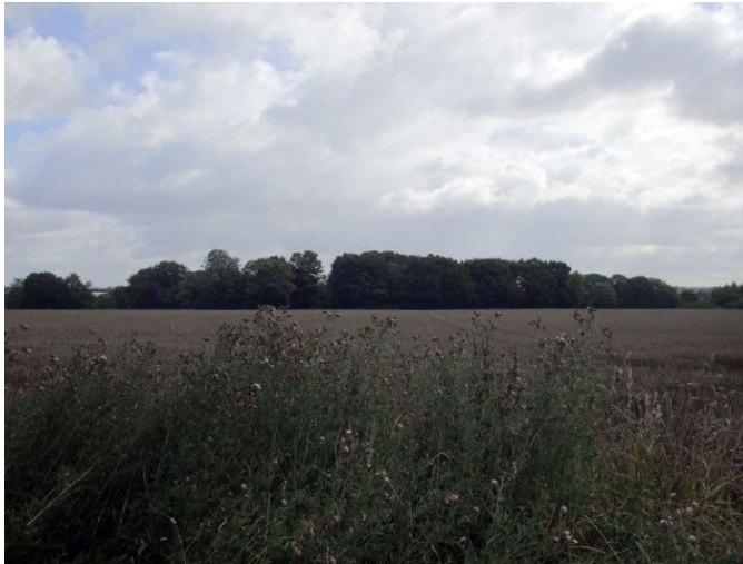
Picture 5.3 View from the end of Park Lane over open countryside

5.12 Within Fazeley the public realm and open spaces are of mixed quality and would certainly benefit from improvements. There is a considerable amount of visual clutter including street furniture, signage and railings which could be reviewed.