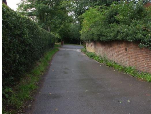
Picture 5.1 View down Park Lane, Bonehill

retains a rural feel with narrow roads, with no pavements or pavements only on one side and some unadopted roads the character and appearance of which are all integral to the significance of the area.