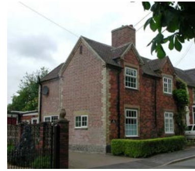
Picture 6.3 The Cottage

6.3 There are a number of late 18th century/early 19th century buildings within the village including the three storey Poplars residence, the classical Old Rectory and the Grade II listed Homestead. All are red brick with clay plain tile roofs, The Old Rectory has sash windows but the Poplars and the Homestead have the more functional and typical casement windows.