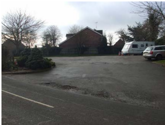
Picture 8.4 White Lion car park

8.3 The car park opposite the White Lion is an area that could be improved. While it has some vegetation on the boundaries that partly screen it, it remains a negative element within the conservation area.