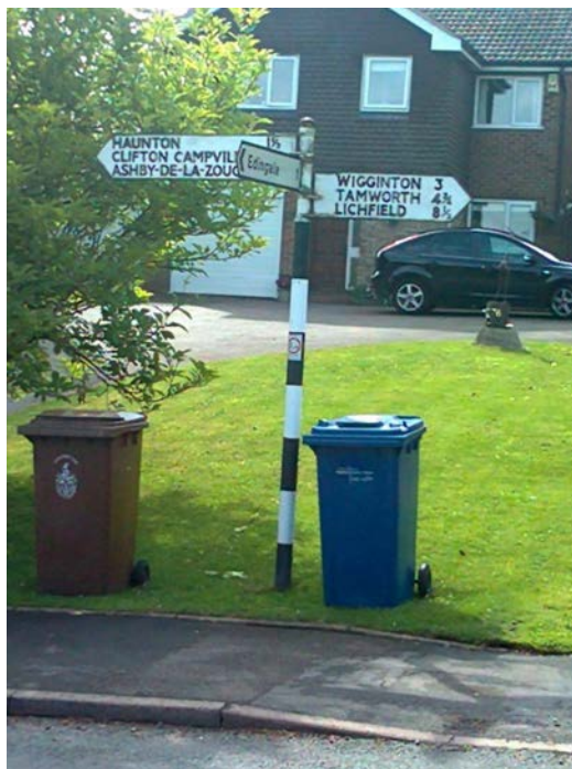
Picture 9.1 Traditional fingerpost sign

9.1 The character of the conservation area is determined by more than the appearance of its buildings. Spaces between buildings are also important and the quality of elements such as boundary treatments (walls, fences etc.) hard landscaping (paving, kerb edging, and road surfaces) and street furniture (street lights, benches etc) affect the way in which the conservation area is perceived. Small improvements, taken cumulatively, can make a significant impact and, conversely, the incremental loss of traditional features and their inappropriate replacement can have a considerable detrimental effect.