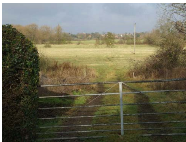
Picture 7.5 View out to open countryside