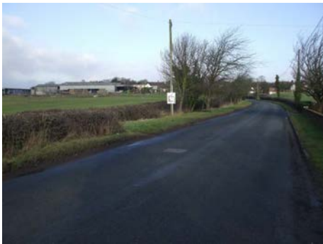
Picture 8.1 View of Church Farm buildings.

8.2 There are some buildings which have a negative impact on the conservation area. These are the large, modern industrial style farm buildings at Church Farm and Fishpits farm and also the timber building directly opposite the White Lion. If the opportunity arises to replace these buildings they should be replaced with buildings that are more appropriate to their location within a conservation area. The buildings at Church Farm are highly visible on the approach to the village so the appearance of the village would be greatly improved by removing or replacing these structures.