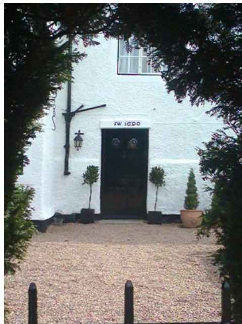
Picture 4.1 The Manor - datestone reads FW 1690

4.6 The village contains two important timber framed buildings, The Manor House dating to c1600 and The Manor dating to c1690 both on Main Road.