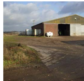
Picture 8.3 Building at Fishpits

8.3 The car park opposite the White Lion is an area that could be improved. While it has some vegetation on the boundaries that partly screen it, it remains a negative element within the conservation area.