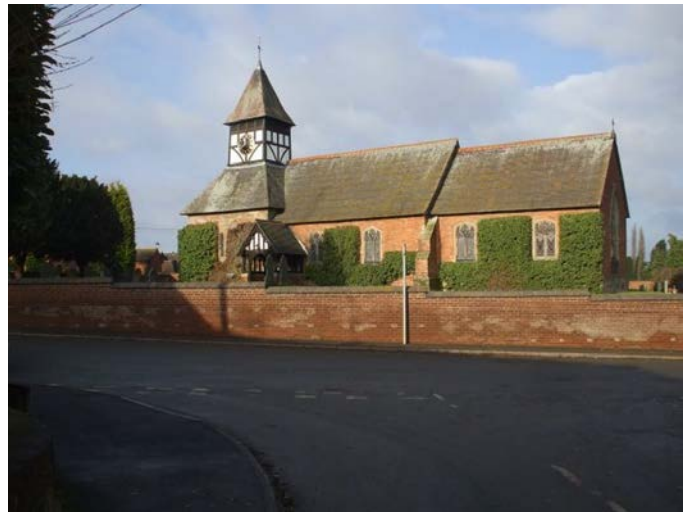
Picture 5.2 St Matthew's Church

5.2 Advancing further towards the church, and set back from the road, the more substantial properties of Harlaston House, and the Rectory, both of Georgian style come into view. The latter dating from the 18th century and the former being a 20th century replica, which complement each other and create an air of affluence. As the road curves away to the north-east by the church, the White Lion Inn provides a strong focal point and closes the view further down the hill. It is positioned on an island site at the junction of Main Road with the roads running north towards Alrewas and Edingale. Continuing down the road to the north-east, the eye is drawn towards the 18th century Homestead on the left hand side and then focuses on open countryside as the village boundary is passed.