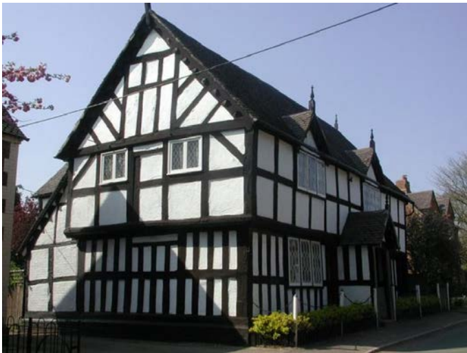
Picture 5.1 The Manor House

5.1 The primary focus of the village is St Matthew's Church at the brow of the hill, which neatly closes the view when approaching from the south. This route in to the village is enhanced further by an attractive group of cottages on the left, which includes the Grade II listed timber framed manor house, whilst on the right, set between modern dwellings is an attractive 19th century property known as The Poplars.