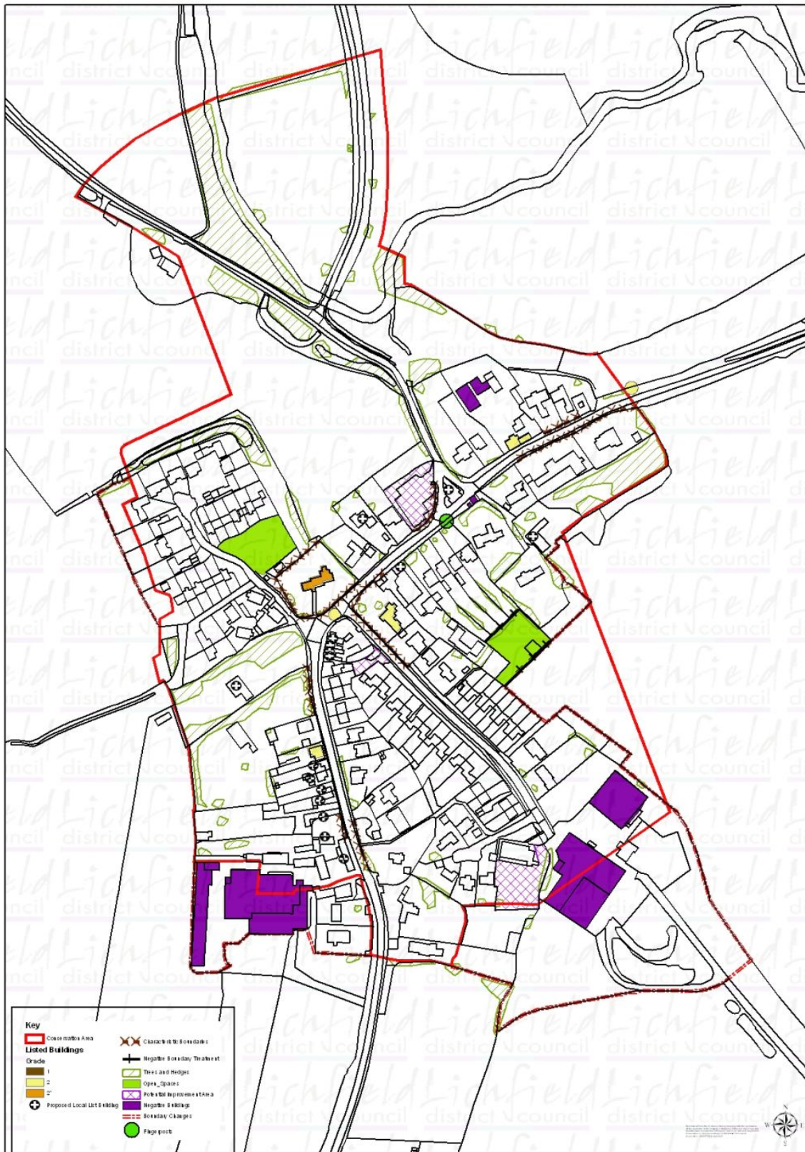
Picture 11.1 Map showing Townscape Qualities within the Conservation Area