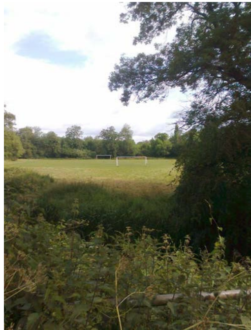
Picture 7.2 Looking over playing fields

7.3 Hedges provide attractive boundaries in a number of locations within the conservation area.