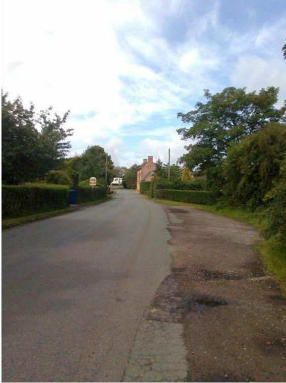
Picture 5.3 View into the village