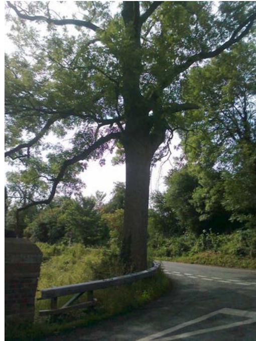
Picture 7.4 Mature individual trees are an important part of the area's character