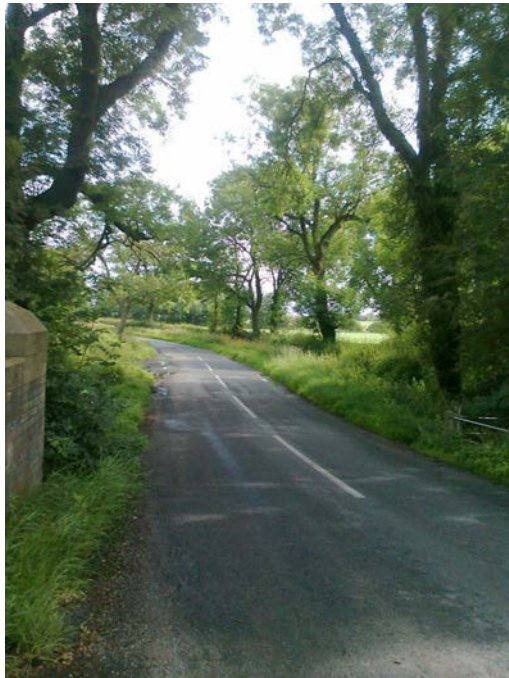
Picture 7.1 Trees lining the road

7.2 Mature trees, both individually and in groups form an important part of the character of the conservation area. Substantial tree cover to the north of the village boundary along the road side, field boundaries and the banks of the river in a wholly rural location contrasts with sparser levels of tree cover in the built area of the village, softening the transition from the open countryside to the rural settlement.