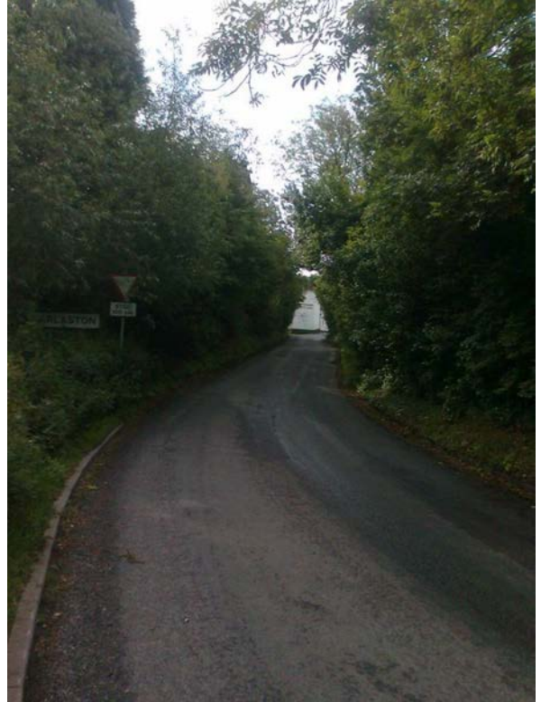
Picture 5.4 View towards the White Lion

5.3 Where the road splits to the north at the White Lion Inn, the road bends and forms an attractive junction at the bridge over the river towards Edingale with trees lining each side of the road, the overall impression is of a tranquil and intimate landscape. Looking back, and coming back in to the village, the White Lion Inn again dominates the scene and closes the view.