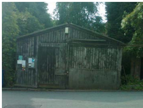
Picture 8.2 Building on Main Street .