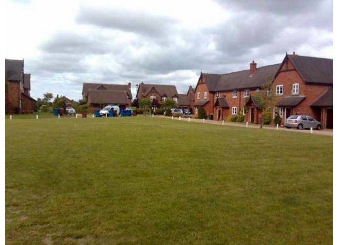
Picture 6.5 View across the green into Churchside development

6.5 Most of the buildings appear to have been adequately maintained over the years though some have inevitably suffered from unsympathetic alterations/repairs carried out in non-traditional materials.