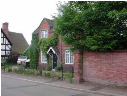
Picture 6.1 Rectory Gate

6.2 The row of cottages between Church Farm and Harlaston House display charming frontages in English bond brickwork with random vitrified headers and decorative buff bricks to the quoins. Windows are also decoratively framed with stone lintels and sills with buff brick reveals, whilst the roof tiles are laid in an attractive fish-scale arrangement.