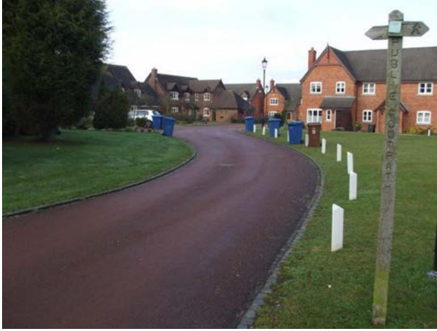
Picture 6.4 View of Churchside development