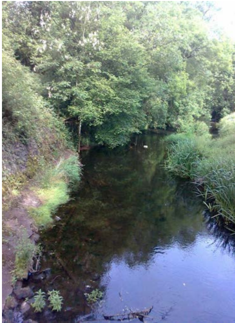
Picture 7.3 View of the river