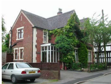
Picture 6.2 Holly Cottage