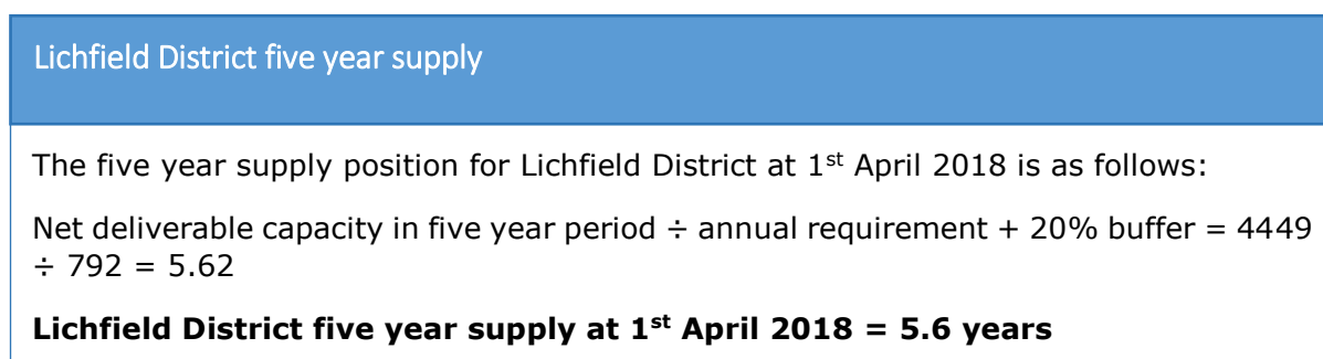
Figure 4: Lichfield District five year housing land supply calculation at 1 st April 2018

4.5 The calculation demonstrates that there is a five year supply of housing land in the District at 1 st April 2018 compared to the local target set through the Local Plan Strategy. All the data for sites contained within the Five Year Supply can be found at Appendix B.