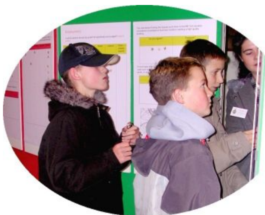
Picture 3.1 Burntwood Public Participation Event

3.1 The further development of the evidence base underpinning the Core Strategy and ongoing public participation will identify issues that need to be addressed by the Lichfield District Local Development Framework. However it is essential that the local community has its say to ensure that all issues have been identified and are being fed into the process. We want to know the issues that you think should be addressed through the Core Strategy or need further investigation.